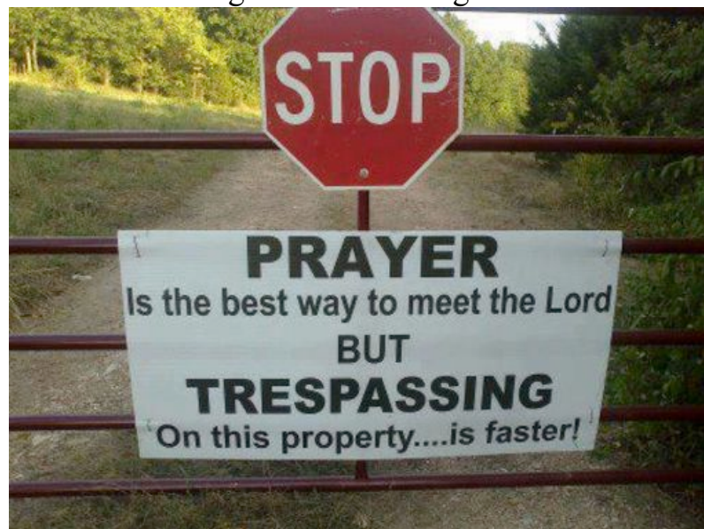
Sign on a farmer's gate