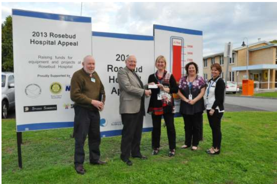
Presentation of $50,000 to the Rosebud Hospital CT Scanner Appeal, 15 th May 2014

Loyal Toast : To Her Majesty the Queen, Australia and Rotary.