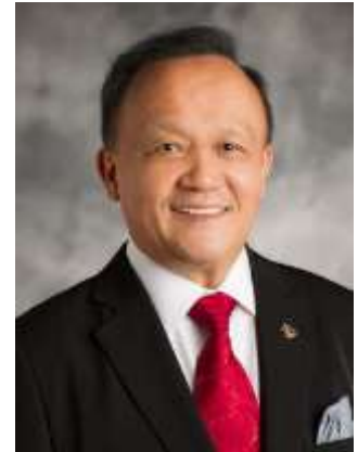
Rotary International President: GARY C.K. HUANG

Part of our Club Development program is a review of the process so far. At our meeting this week there will be a review survey available. You are invited and encouraged to provide your feedback so the work of making our Club what you want it to be can be continued.