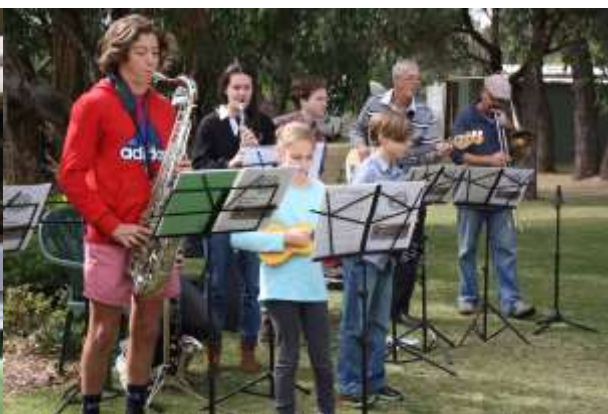
Band On The Run